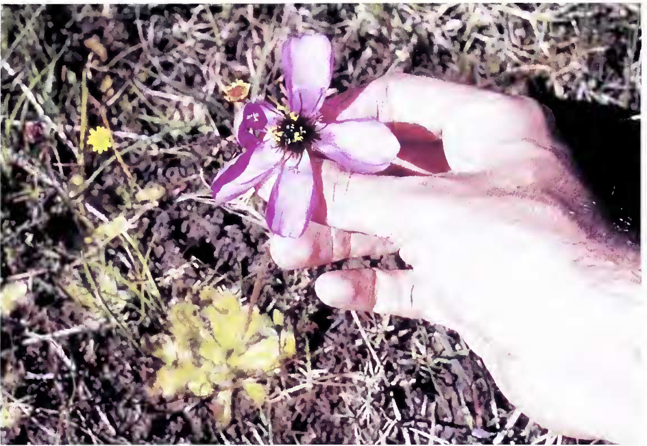
Figure 1: Drosera pauciflora with a flower 7 cm in diameter, Darling South Africa.